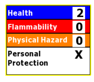
HMIS RATINGS (0-4)