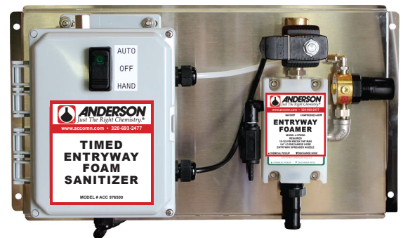
Entryway Foam Sanitizers