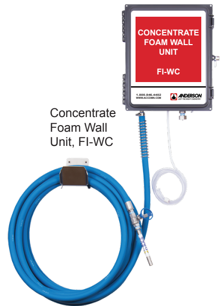
Concentrate Foam Wall Unit, FI-WC