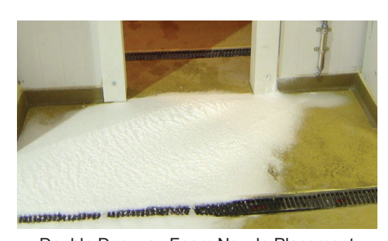
Double Doorway Foam Nozzle Placement