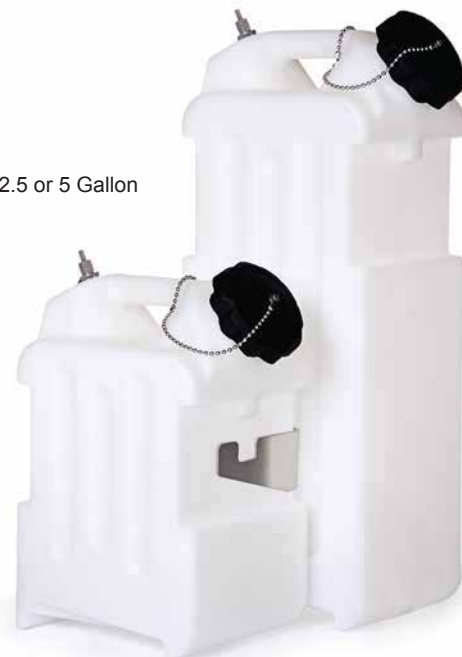
2.5 or 5 Gallon

■ Item Number: J5BKSR 5 gallon jug with black cap, stainless steel rack, and suction line