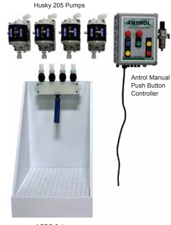
ACDS-8-1 Single Station Dispensing Stand

A thorough evaluation of your equipment requirements can be completed by your Anderson Chemical Company representative.